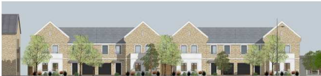
② Proposed Rear Elevation