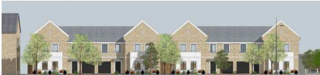
① Proposed Front Elevation