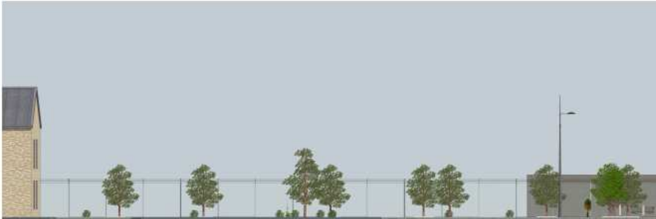
① Existing Front Elevation