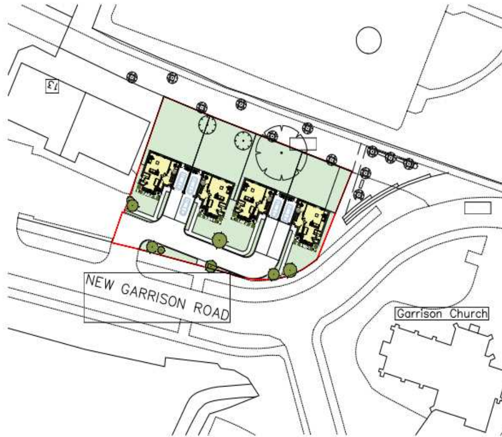
1 Site Plan