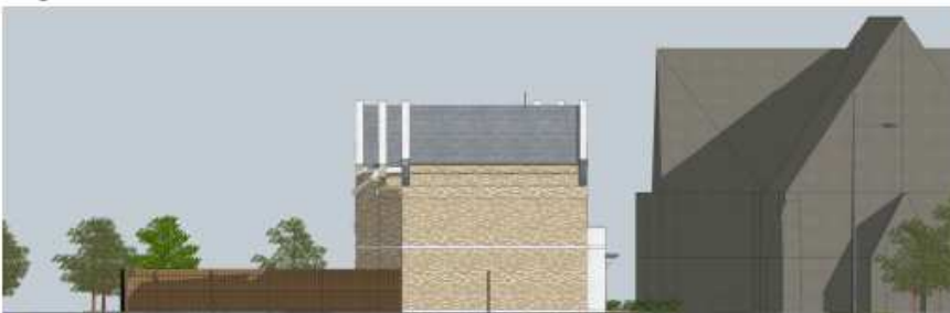
③ Proposed Side (West) Elevation