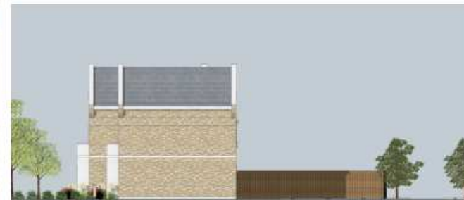
④ Proposed Side (East) Elevation