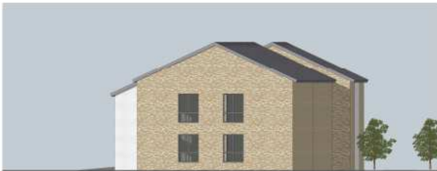
② Existing East Elevation